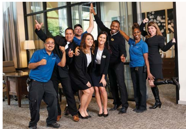
Camden’s front line employees love taking care of their customers.

A few examples of how Camden has supported this philosophy is increasing diversity on its board of