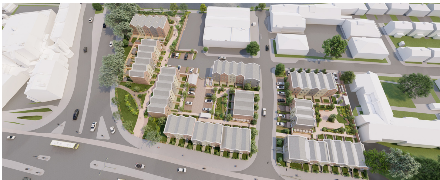
Indicative aerial view of the proposals